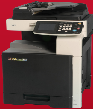
Base Unit with ADFR